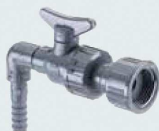
2. Pure water outlet valve