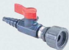
1. Pure water outlet valve