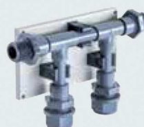
4. Pure water distributor block