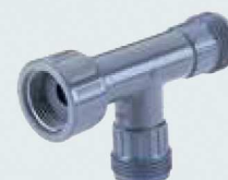
5. Pure water T-connector